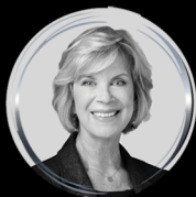
JANICE HAHN LA COUNTY SUPERVISOR